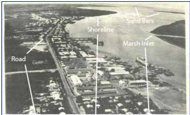
Cat Lo Photo - 1968 ?