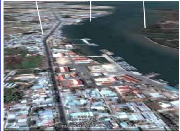
Google Earth Photo - 2009

And....as long as we're talking about Cat Lo -